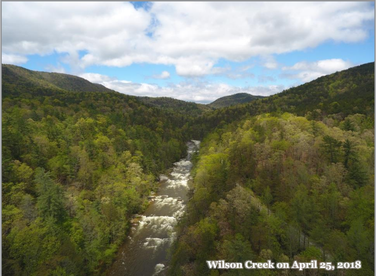
Wilson Creek on April 25, 2018